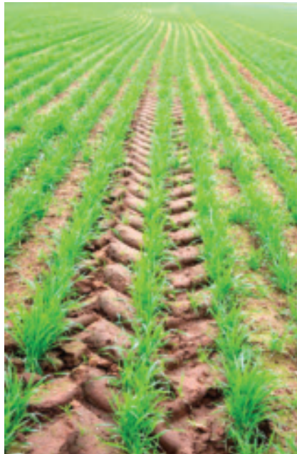
USING THE RIGHT FLUID PRODUCTS IN-FURROW AT SEEDING CAN AID SOIL RECOVERY FROM COMPACTION CAUSED BY HEAVY MACHINERY.

Deliver liquid soil conditioner and ameliorant solutions into the furrow at planting to increase the water harvesting performance of conservation tillage, change and manage soil variables such as pH and electro conductivity (EC) and improve soil structure and stability values.